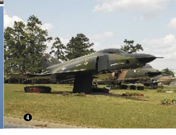
|4| Three aircraft assigned to Shaw over the years are (I-r) RF-4C, EB-66A, and RF-101.